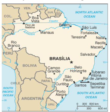
Figure 1.Port of Santos localization

The Port of Santos, the biggest in Brazil, is located in the Brazilian central coast (Fig.1), 90 km from the city of São Paulo (25° 53' South 46° 19'West), a gateway to the most heavily industrialized regions.