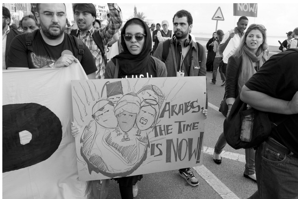
A large enthusiastic crowd participated in the climate march and rally along the historic Corniche on Saturday.