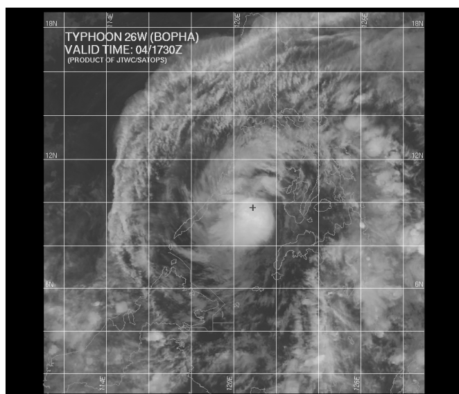
US Navy Joint Typhoon Warning Center

ECO email: administration@climatenetwork.org - New ECO website: http://eco.climatenetwork.org - Editorial/Production: Fred Heutte