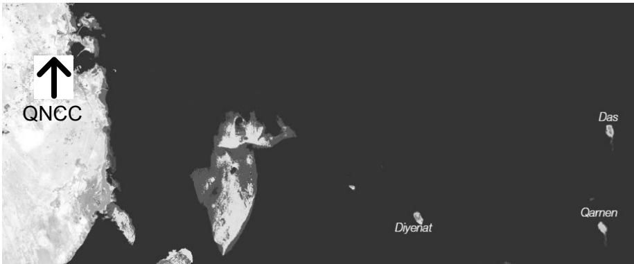
The spectacular coral reefs off the coast of Qatar are experiencing severe degradation from pollution, illegal fishing and other causes. Now climate change threatens to raise water temperatures above those that coral reefs can tolerate, putting the diverse fisheries of the Gulf at risk. Excerpt from map by EWS & WWF.